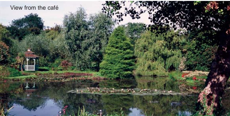
View from the café

The café is ideal for breakfast meetings, business functions, Christmas parties and other special occasions.