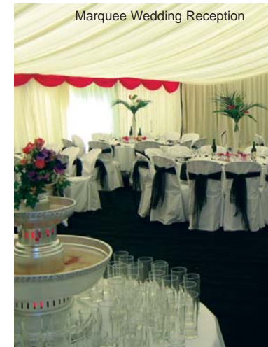
Marquee Wedding Reception