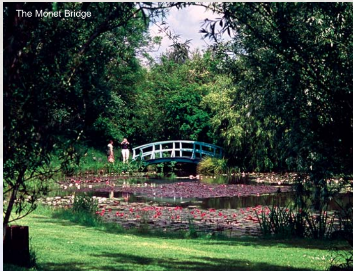
The Monet Bridge

Many of the original water lilies planted here by the Bennett family in 1959 came from the same nursery in France that supplied Monet's garden in Giverny. These same varieties that Monet painted are among the collections held here today. The Monet style Japanese Bridge was commissioned here in 1999 to commemorate 100 years since Monet's painting 'Water Lily pond 1899' and recreates the painting of a bridge over a water lily pond.